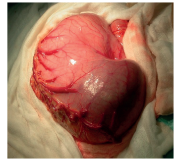
Figure 2. Intraoperative image