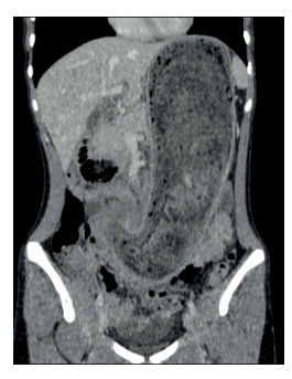
Figure 1. CT image, stomach filled with trichobezoar

Abdominal X-ray and ultrasonography revealed abdominal mass. Diagnosis was confirmed in abdominal computed tomography – CT (Figure 1). All three trichobezoars were removed from the intestinal tract during laparotomy with wide gastric wall opening (Figure 2). In one case – Rapunzel syndrome – hair mass was removed also from the duodenum and small bowel (Figure 3). There were no complications in the postoperative period. Hospitalisation time was approximately two weeks. Oral feeding was administered in 10th postoperative day. After the removal of trichobezoar all patients were referred to a psychiatric treatment.